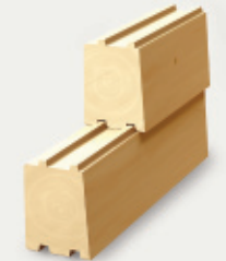
Weatherbloc® 8° Bevel