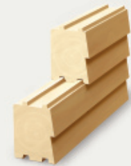
Weatherbloc® 4° Bevel