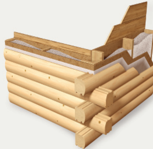
Thermo-Home® (Panelized Building System)